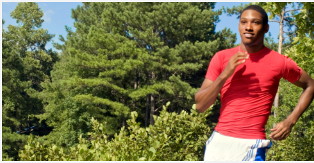
UMMS Population Health Clerkships in 2020