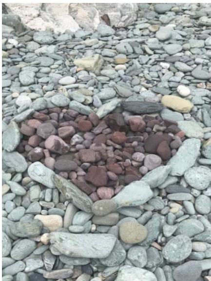
At the edge of the world, there's still goodness to be found.

In the last issue, we provided resources for exercise and meditation. Creative expression through writing, music, dance, and the visual arts can be powerful contributors for staying focused and centered. This week, we highlight various artistic contributions of our Department members.