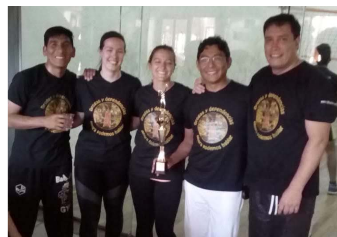
Members of the healthcare team of IDH at a Wallball tournament to support the LGBT community

The secondary goals of my time in Bolivia were to learn about caring for HIV/AIDS patients in a developing country, and support IDH in other aspects of their health program.