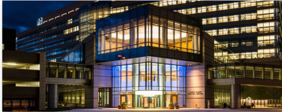
Junior Faculty Development 2024 Virtual Poster Event