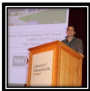
Students & Postdocs