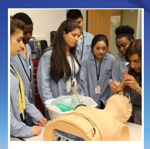
Medical Scholars Airway Skills Training