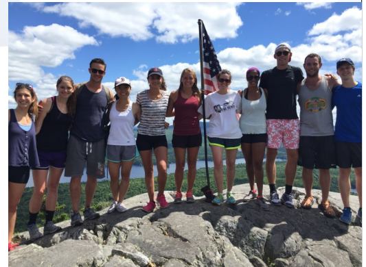
Students attend MOE rafting trip before starting medical school

Governor's Citation for Public Service- Commonwealth of Massachusetts Learning Community