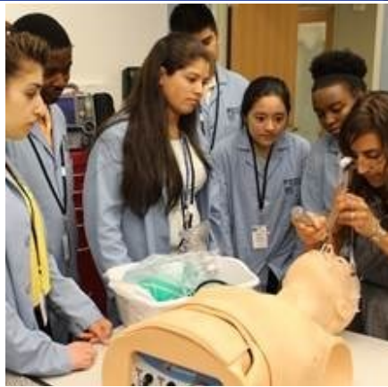
Medical Scholars Airway Skills Training