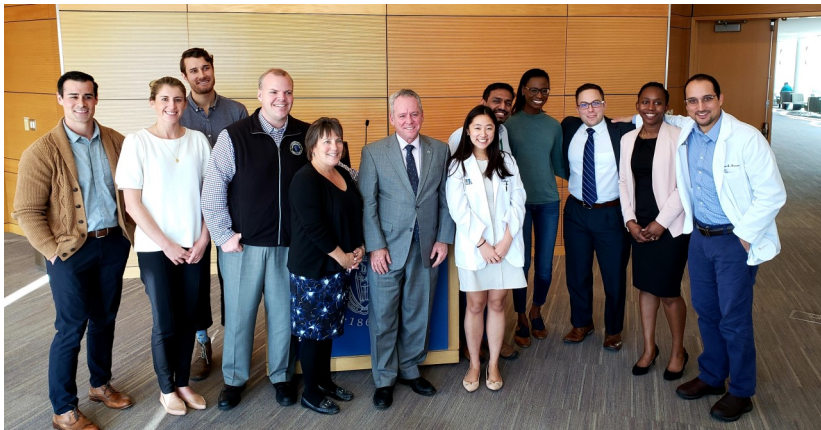
Students meet with members of the Joint Committee on Higher Education