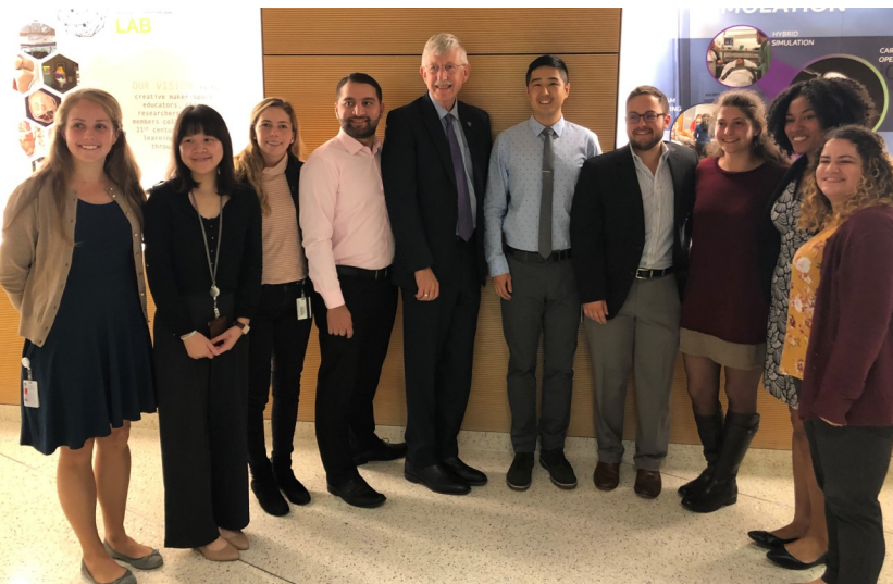
NIH Director Dr. Francis Collins with GSBS students