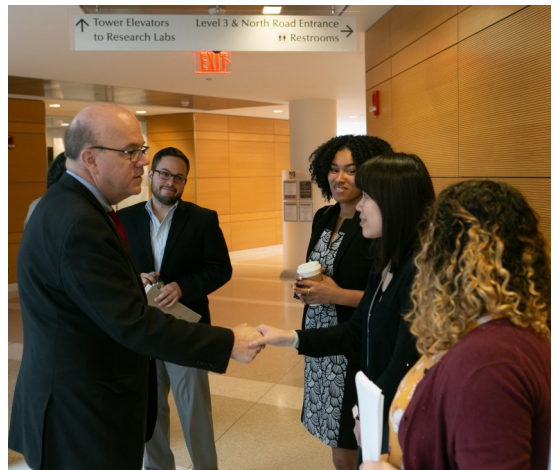
Congressman McGovern greets students on his visit to UMMS

“Interfacing with legislators and other government officials, such as the director of the NIH, affords students the opportunity to present the most pressing and pertinent issues imminently affecting our professional and career development. In return, we hope these leaders keep our perspectives in mind when directing their efforts and dictating policy strategies moving forward.”