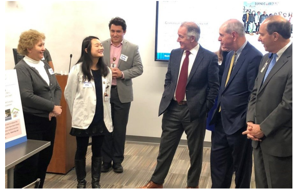
Congressman Neal speaks with PURCH Student

UMMS students recently had several opportunities to interact with state and federal elected officials and policy makers. In October, NIH Director Dr. Francis Collins, accompanied by Congressman Jim McGovern, visited UMMS and met with a group of students to discuss research funding. Members of the Massachusetts Legislature’s Joint Committee on Higher Education toured the UMMS campus in November and conducted a student roundtable with students from SOM, GSN and GSBS. UMMS Baystate hosted Congressman Richard Neal as he visited to learn more about the PURCH track, meeting with school and hospital leadership, students and community partners.